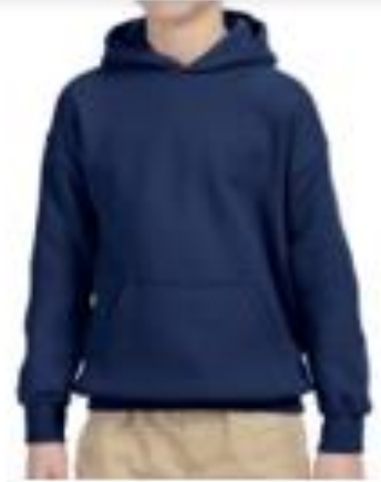
(SC) Pullover Navy Blue Hoodie (Youth) $30