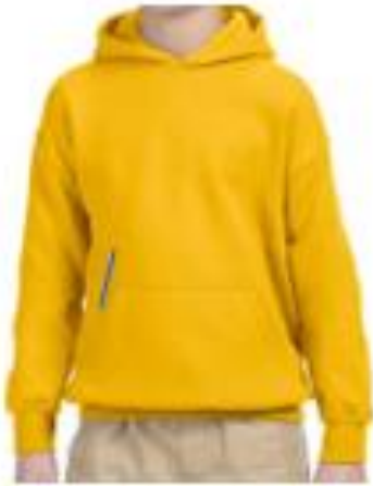
(SC) Pullover Gold Hoodie (Youth) $30