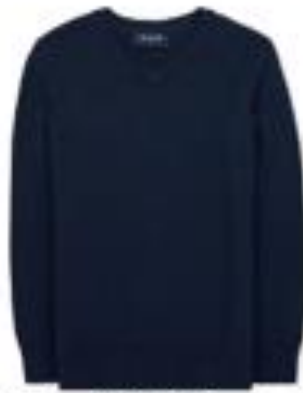
(CP) Uniform V-Neck Sweater Navy Blue (Youth) $40