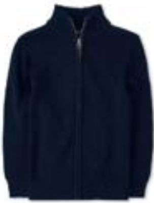
(CP) Zip Up Mock Neck Sweater Navy Blue (Youth) $40