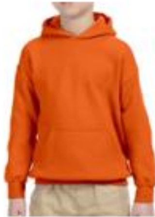
(SC) Pullover Orange Hoodie (Youth) $30