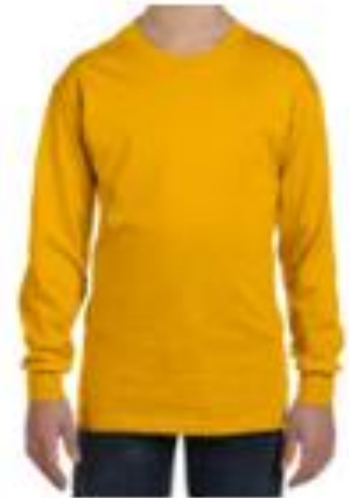
(SC) Gold Long sleeve Shirt (Youth) $20