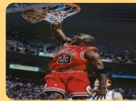
Michael Jordan (Feb 17 th )