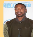
Michael B Jordan (Feb 9 th )